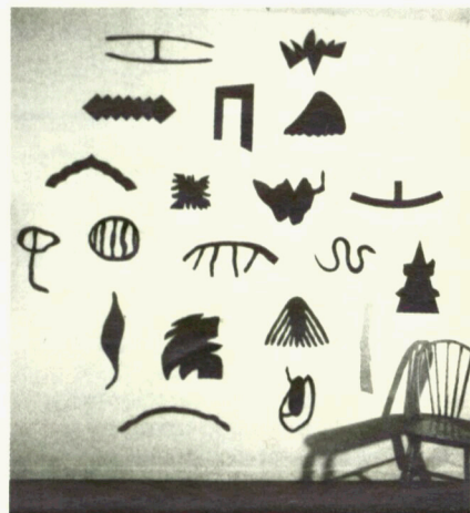
Island Mentality No 2 1981 , Richard Killeen

There is no doubt that the 21 works will make a very stimulating exhibition.