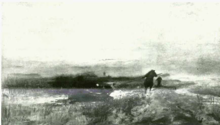
Van der Velden, Dutch Funeral Barge Marken.

Robert McDougall Art Gallery P.O. Box 2626 Christchurch Botanic Gardens Christchurch 1 Telephone 650-915