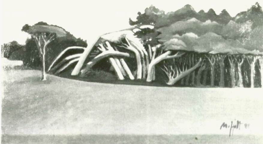
Trevor Moffitt, Southland Series II No 1.