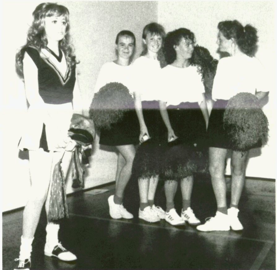
A Cheerleaders group with 'Cheerleader'. The real and the unreal.

This lively event made a good start to 1989 which promises to be a stimulating year for all our members. Our programme is one where every one of you will find events in which you will be pleased to participate. Our resolution is to present exciting events for you and your new member friends to attend and enjoy throughout the year.