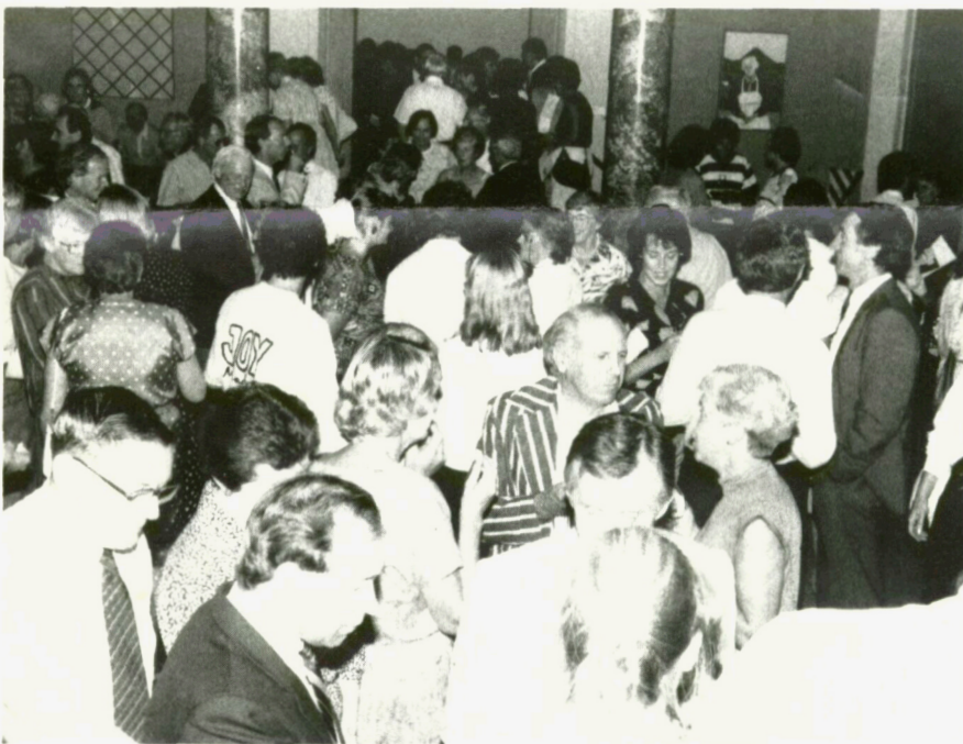
A large crowd enjoying the Duane Hanson Opening on February 2.