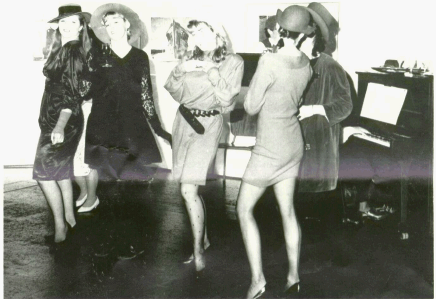
The young team from Hagley High School who entertained so well.