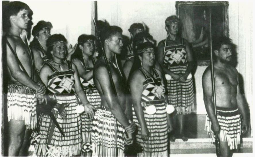
Members of Kotahitanga Culture Group at the opening of 'A Canterbury Perspective'.