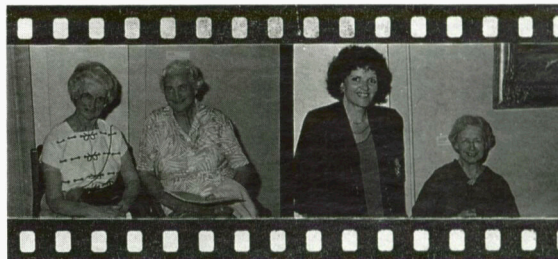
‘At Home and Abroad’ opening.