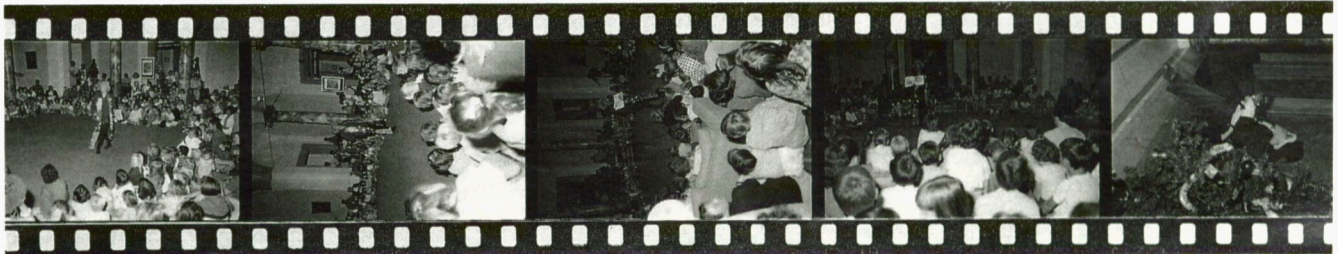
Margaret Mahy story-telling at Christmas time.