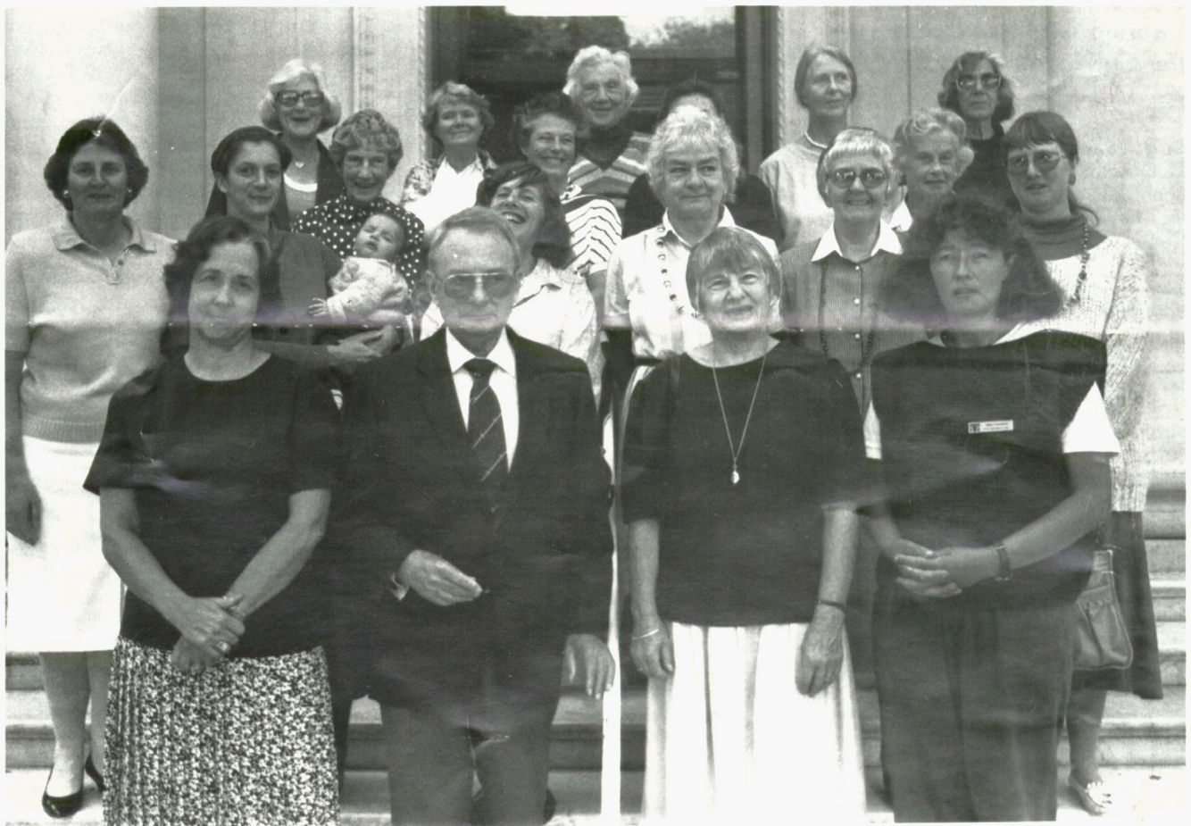
A group of 'Friends' viewing the sculptures at the Aigantighe Art Gallery during March.