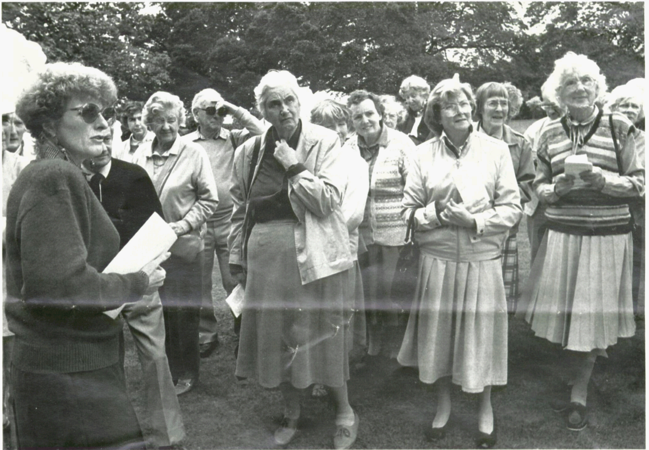
A group of our very enthusiastic volunteer Gallery Guides at Easter Time.