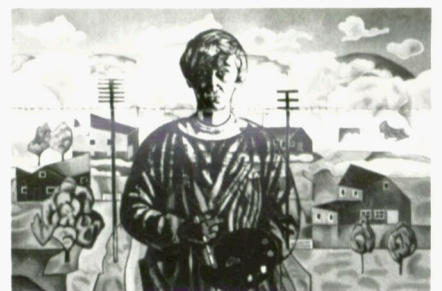
Ian Scott Rita Angus acrylic on canvas (collection of the artist)