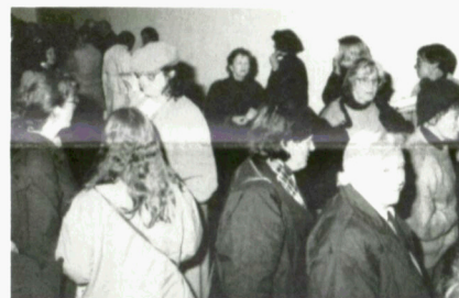
Edward Lucie-Smith Public Lecture Over 160 people attended the Edward Lucie-Smith public lecture at the Annex in April on Art Since 1970 .