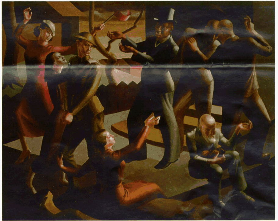
War Makers 1937, Lois White, Auckland City Art Gallery.