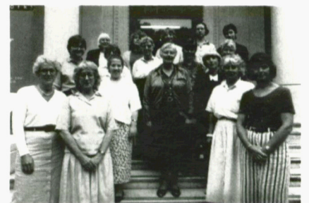
New Guides finish their training.