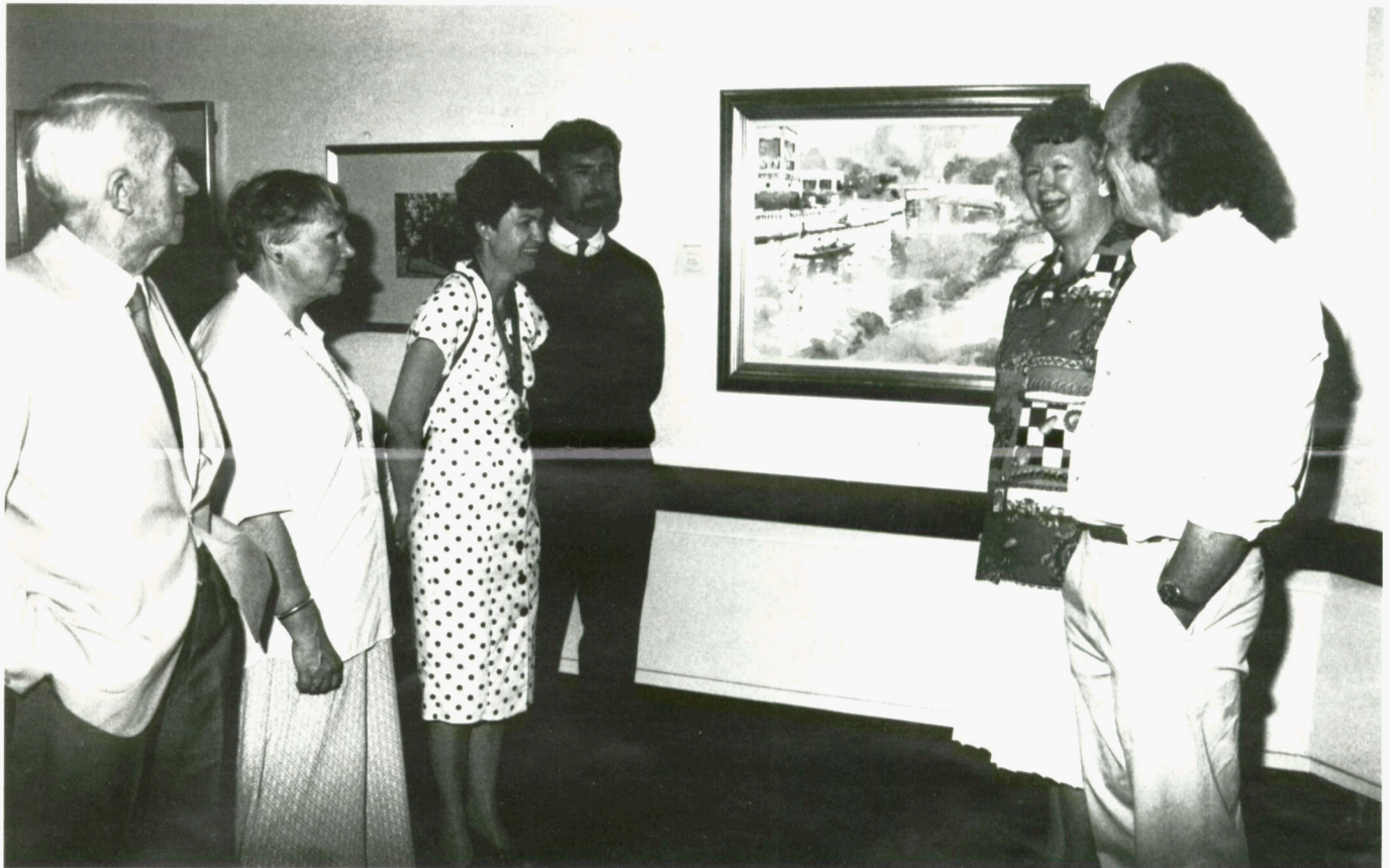
Visitors from Christchurch, Dorset and local artists enjoying the About Town exhibition.