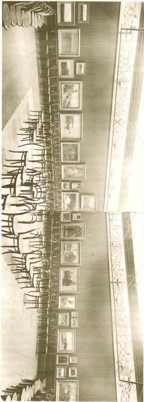
Durham Street Gallery extensions: view of permanent collection in gallery/ballroom, c. 1910.