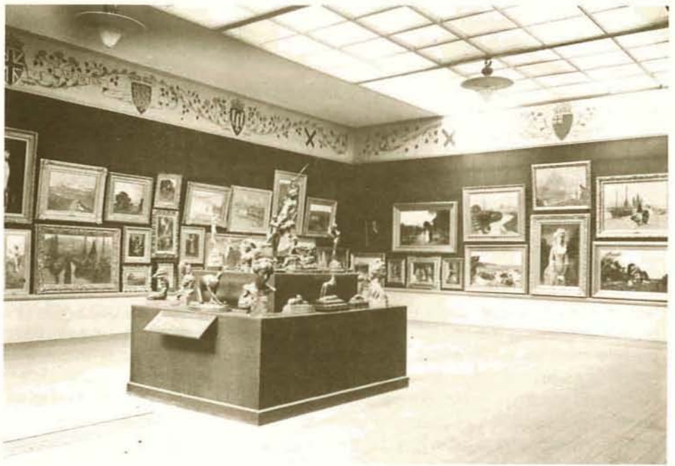
View of British Fine Art Section at 1906-7 International Exhibition, Exhibition Buildings, Hagley Park, Christchurch.