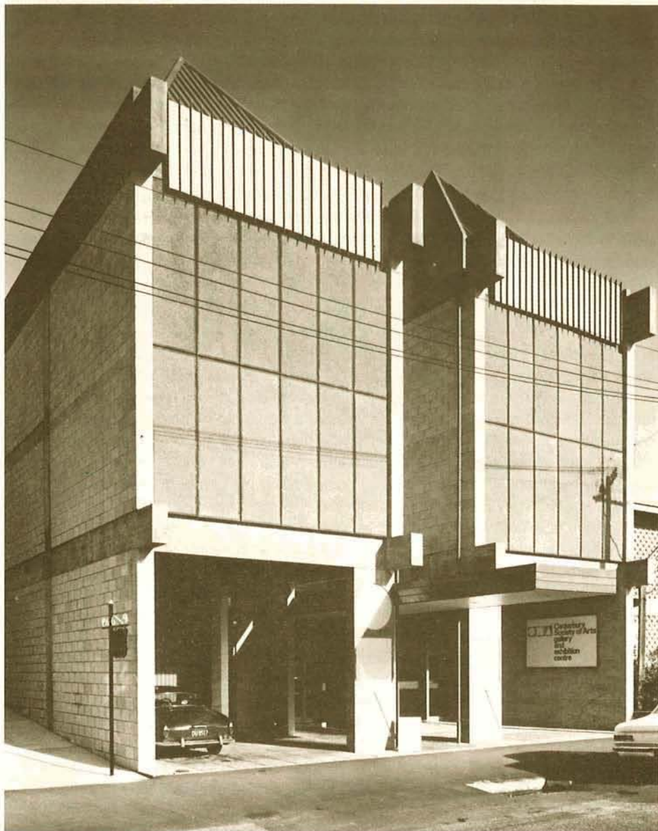
The new Gloucester Street Gallery.