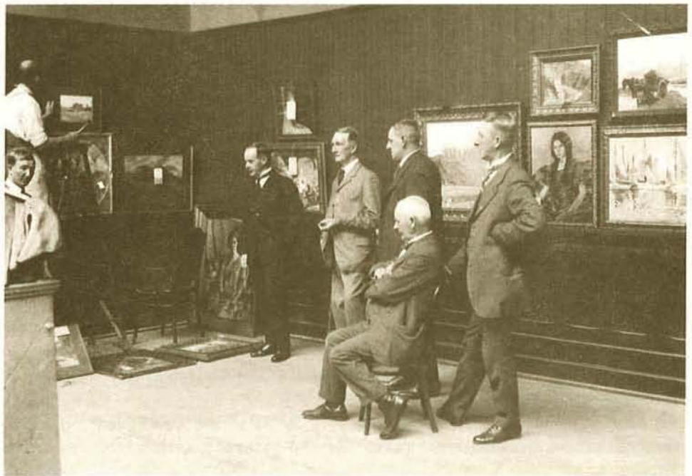
The Hanging Committee in 1925.