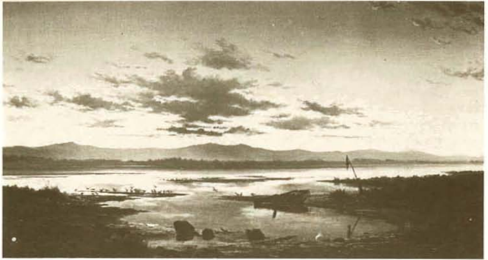
John Gibb Shades of Evening , 1881 (Cat. No. 1). The Society's first purchase for the permanent collection.