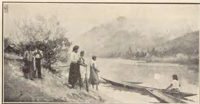
No. 114. ON THE WAIKATO.