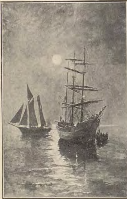
No. 53. THE PIRATES' STRATEGY. C. E. BICKERTON.