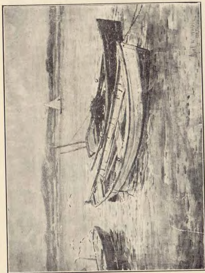
FISHING BOATS, KAIAPOI.