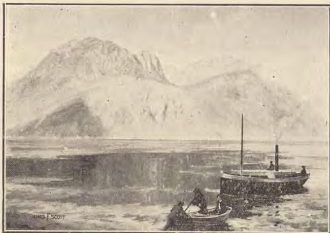
No. 28. LAKE MANAPOURI.