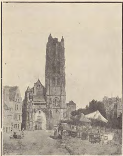
No. 241. ST. LAURENT, ROUEN.