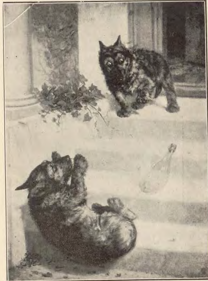
NO. 121. TWO SCOTCHES AND A SPLIT SODA. W. A. BOWRING.