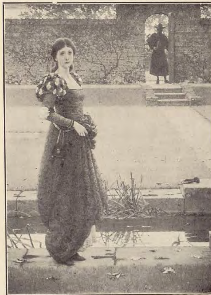
No. 357. THE WIZARD'S GARDEN. G. D. LESLIE, R. A.