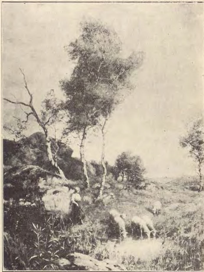
No. 355. A POOL AMONG THE HILLS. SIR ERNEST WATERLOW, R.A., P.R.W.S.