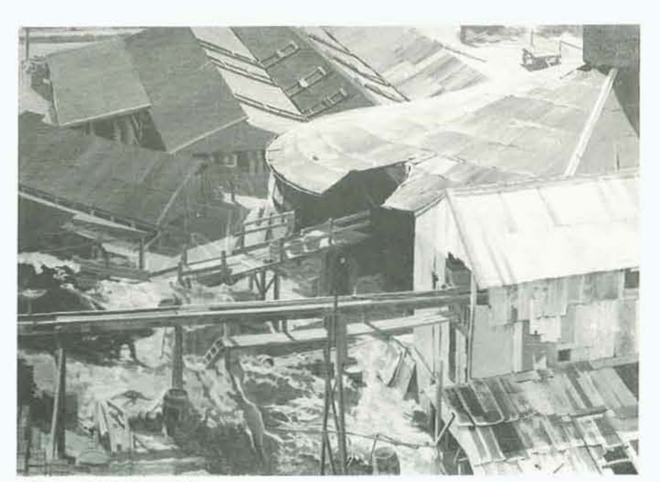
Hillside Brick Kiln 1936.