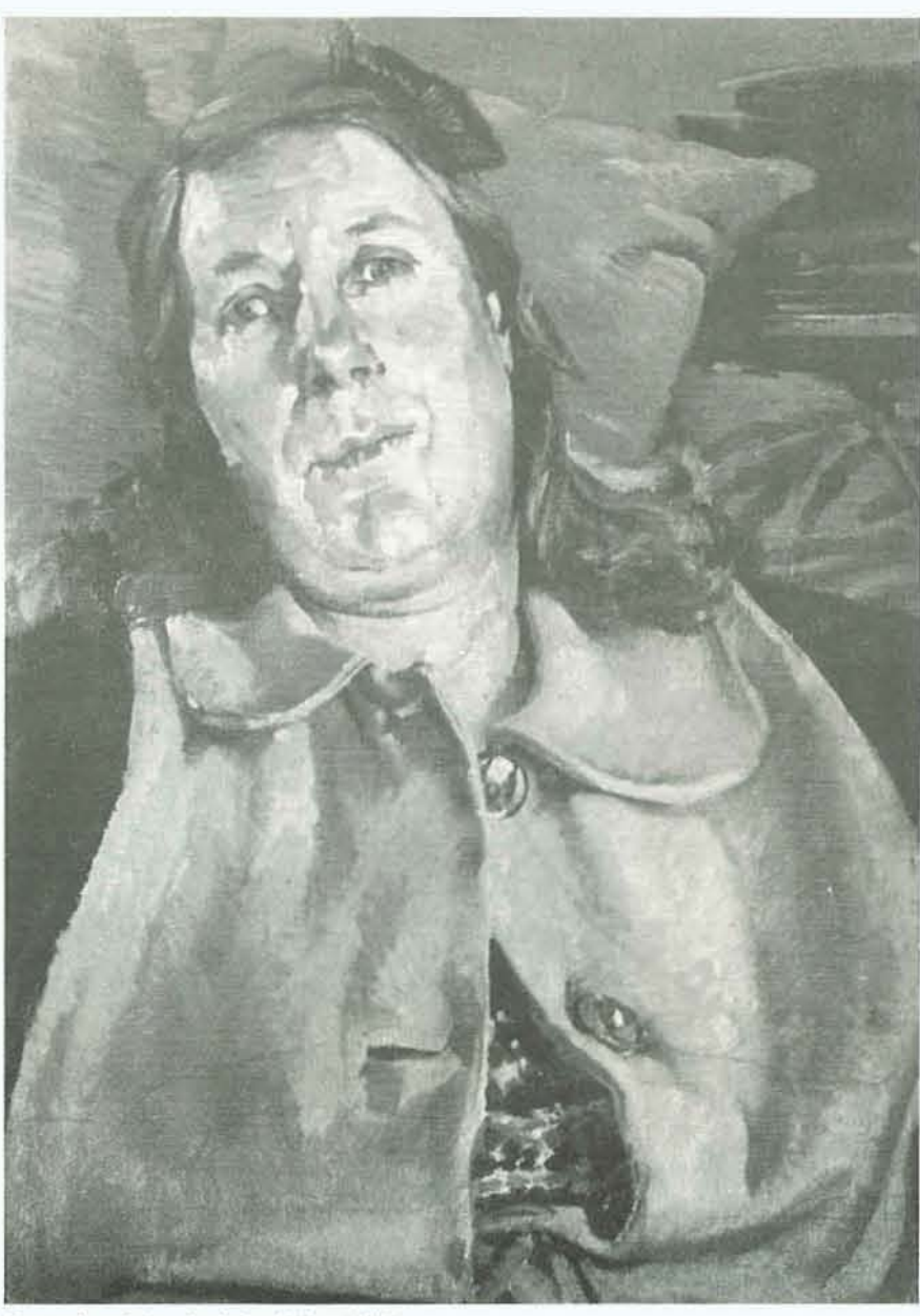
Portrait of the Artist's Wife 1947.