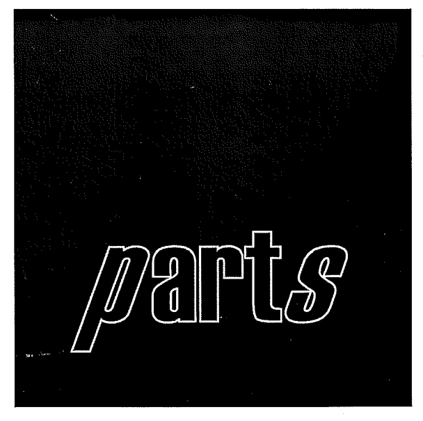
Robert McDougall Art Gallery