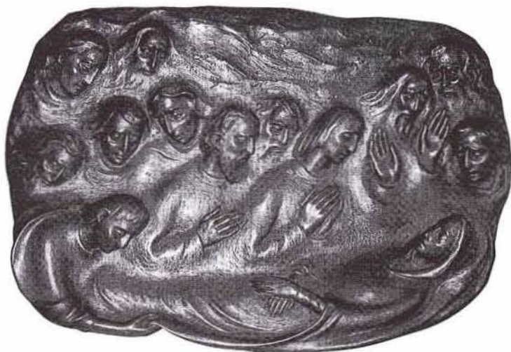
Dormition of the Virgin 1965