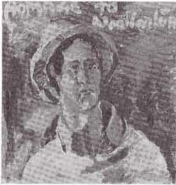
Homage to Woollaston, 1972 oil on board, 590 x 565mm Waikato Museum of Art and History

absence of figures suggests human presence, imparts a resonance of feeling to McWhannell's early regional land- and city-scapes, whereby the deserted environment becomes a receptacle for an outpouring of emotion.