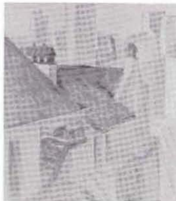
Auckland Landscape, 1982 oil on canvas, 675 x 595mm Waikato Museum of Art and History

among the ranks of the 20th century Moderns. 7