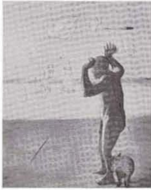
Bless My Soul, 1986 oil on canvas, 915 x 709mm National Art Gallery and Museum

child's confident rejection. While these images are overtly self-referential, there is a quality of manic alienation about them which avoids a slide into mawkish sentimentality. Cool tones, tense perspectives, and inscrutable symbolism describe situations of concentrated experience suffused with irony, in which characters parody themselves and mock one another.