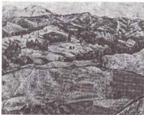
Neudorf, Upper Moutere, 1976 oil on hardboard, 840 x 1050mm Robert McDougall Art Gallery