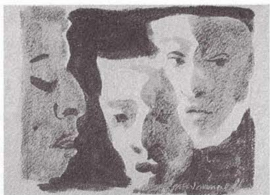
3 Heads (3 Tones), 1990 watercolour Private Collection

proach which recalls the watercolour method, its structural looseness and requirement for hasty resolution prevented complex composition. These works were produced with direct application of colour without preliminary drawing. Using this method of working, McWhannell was able only to render one figure at a time: the compositional and psychological interrelationships of groups, and the changes needed to effect their final resolution, were temporarily beyond his means.