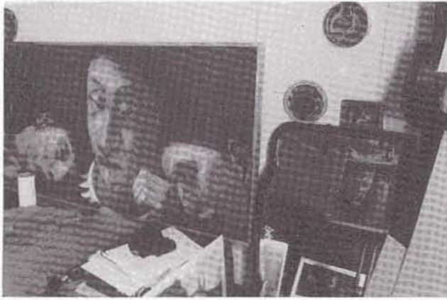
Yet We Have Gone on Living, 1990 oil on canvas Private Collection

the Wilderness (1986). The latter is one of the most visually succinct images which McWhannell produced during the second half of the 1980s. It depicts a naked bearded figure seated alone on a plain against a darkening sky, gazing across a barren landscape of rocks and tree stumps. The mood of the image is one of impotence, the character's naked ineffectiveness extended by the twisted phallic form of the dead tree in the mid-ground. The mental tension of the figure is reflected in his hunched form, plump torso and arms preparing for physical action while thin wasted legs project limply in front of him. In this image, McWhannell couches his preoccupation with existential dilemma in the guise of religious vision, an alternative narration of the adventures of the human spirit. The religious/spiritual context for this work allies it to the images of the European visionary painters: close compositional parallels can be located in Dominico Veneziano's similarly romantic treatment of the subject, St. John in the Desert (c.1450) in the collection of the National Gallery in Washington D.C., and in Stanley Spencer's Christ in the Wilderness - Scorpions of 1939.