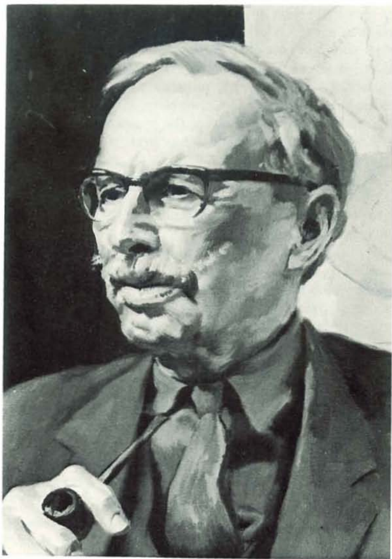
42. Professor J. G. Beaglehole, O.M. 1971.