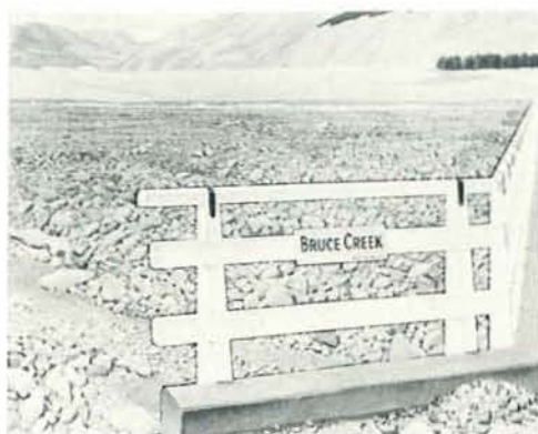
9. Dry September. 1949.