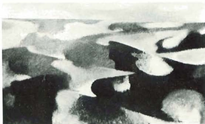
31. Landscape Elements 5. 1970.