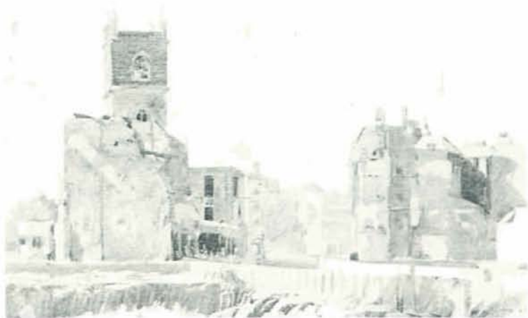
6. St. Giles, Cripplegate. 1947.