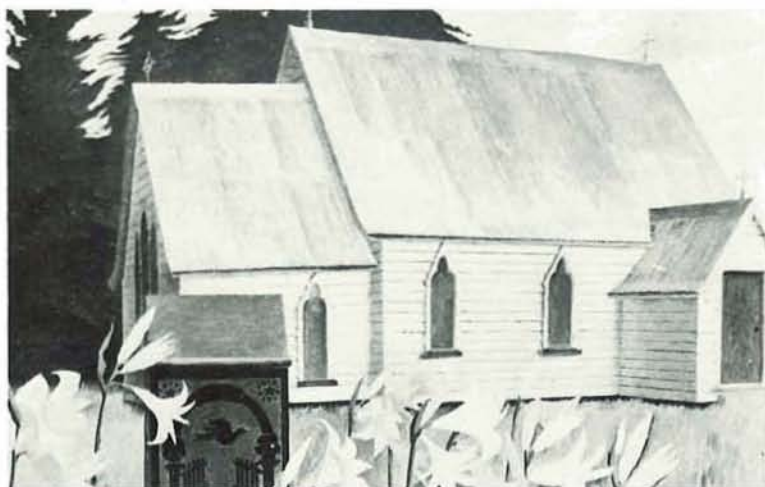
16. Country Church. 1955.