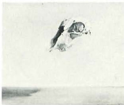
11. Bone and Shadow. 1949.