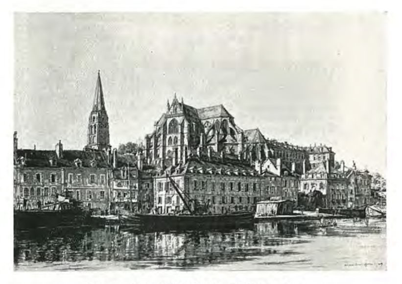
Auxerre (15 x 10<sup>1</sup>/<sub>2</sub>), Muirhead Bone, N.E.A.C.