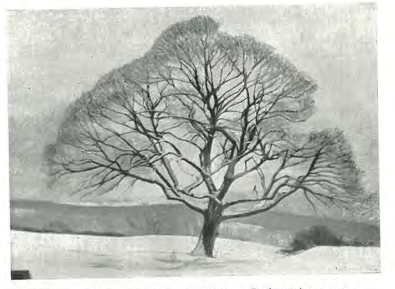
Tree in Winter (39 x 30), Sir William Rothenstein, N.E.A.C.