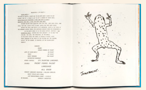
14. Searchings: selections from the artist's Journals chosen and arranged by Alan Loney