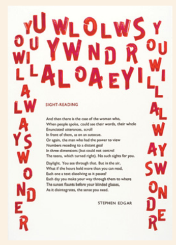
17. Sight Reading