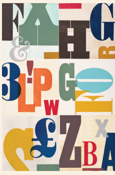
F & X TYPO Design