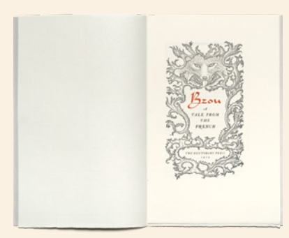
5. Bzou: A Tale from the French