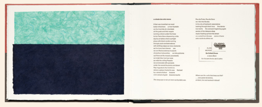
11. Journey to Portugal