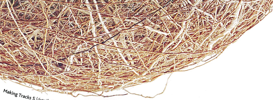
Making Tracks 5 (detail), 2004, marram grass roots