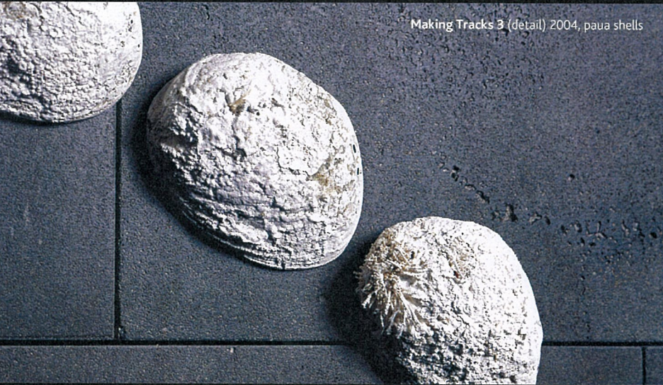
Making Tracks 3 (detail) 2004, paua shells