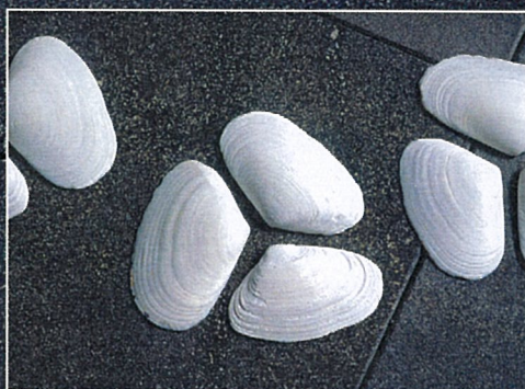
Left: Making Tracks 2 (details), 2004, pipi shells