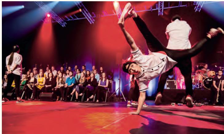
Zion Studios perform at Festival200 in 2014

A day celebrating street art, contemporary New Zealand hip hop and its New York roots. Fresh from winning silver at the 2015 Hip Hop Unite World Champs, local hip hop maestros Zion Studios will be performing and running workshops for all ages and abilities. Create your own street art inspired stencil or make LED light art. Watch the 1983 hip hop film Wild Style , and then take a closer look at street art and graffiti in Christchurch and New Zealand today. See christchurchartgallery.org.nz/events for more details.