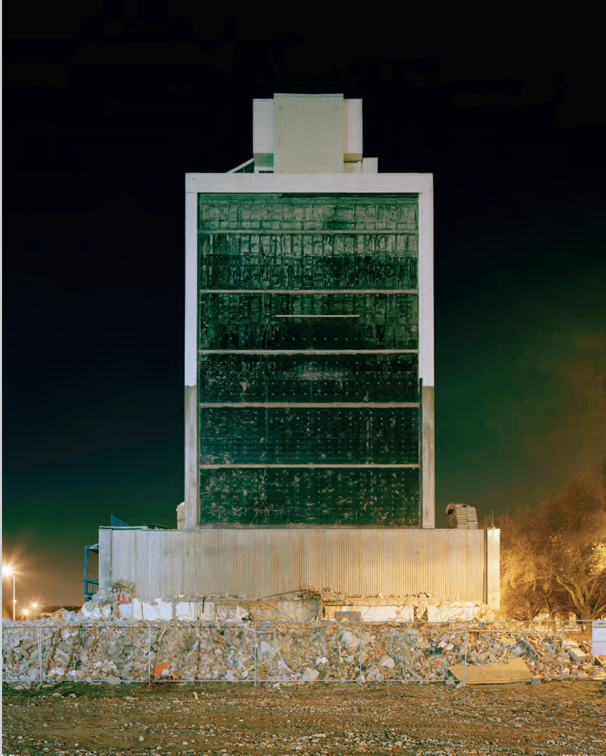
Tim J. Veling Latimer Square, Christchurch, 2012 , from Adaptation, 2011–2012 . Digital C-type print. Collection of Christchurch Art Gallery Te Puna o Waiwhetu, gift of the artist 2012