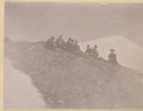
Mt. Torlesse..August. 1892.