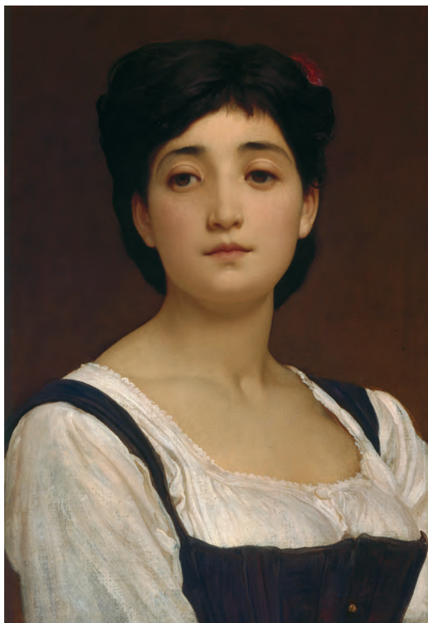
Oil on canvas board. Collection of Christchurch Art Gallery Te Puna o Waiwhetu, presented by the Canterbury Society of Arts 1932