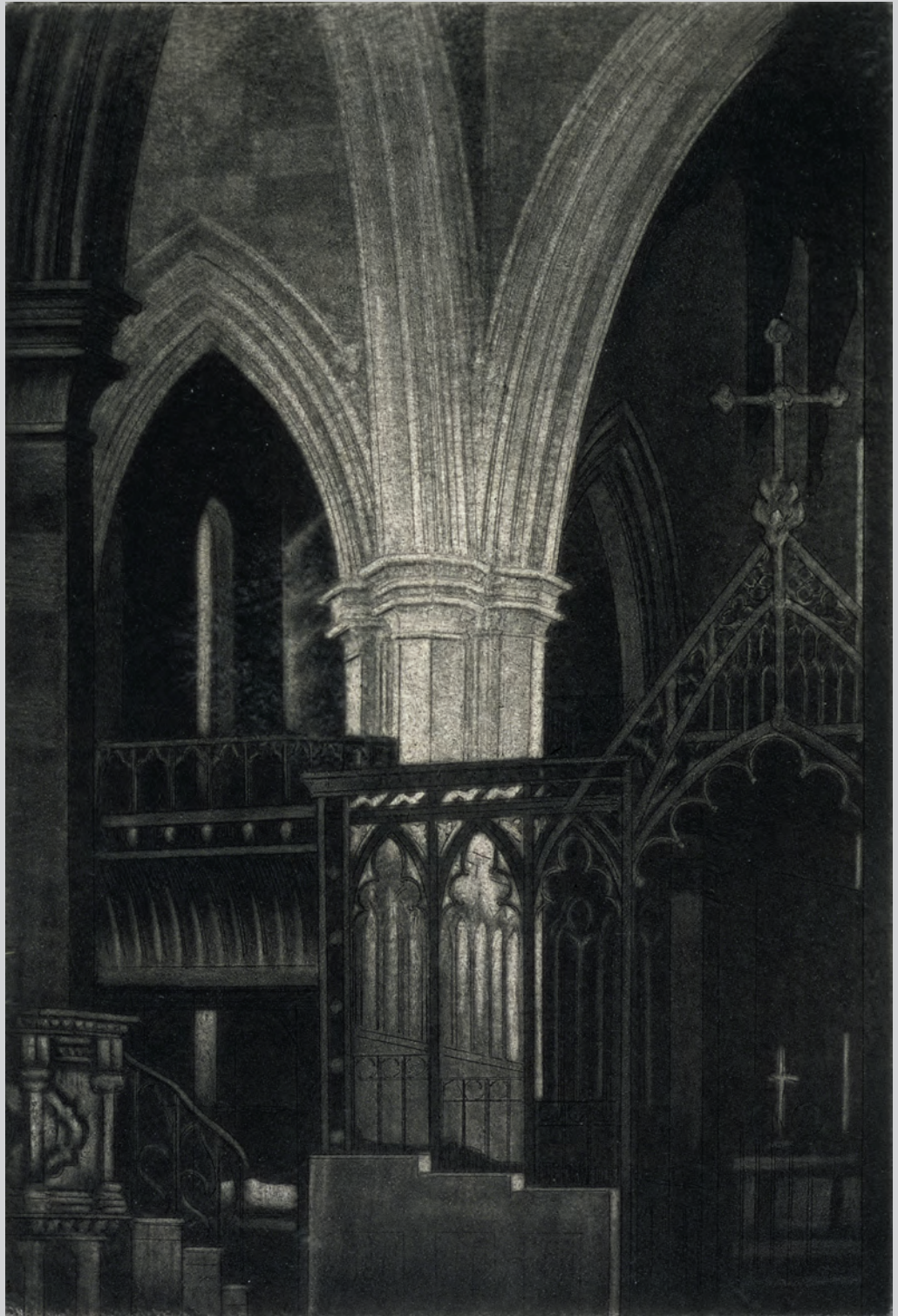
James Fitzgerald The Lighted Pillar 1925. Etching and aquatint. Collection of Christchurch Art Gallery Te Puna o Waiwhetu, purchased 2001