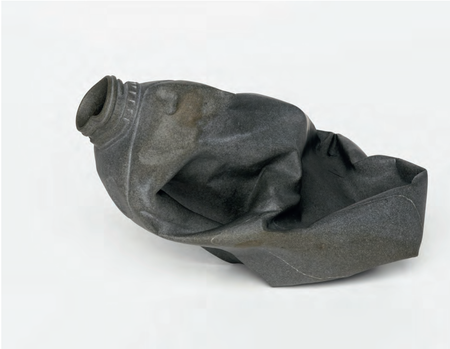
Joe Sheehan Mother 2008. Greywacke stone. Collection of Christchurch Art Gallery Te Puna o Waiwhetu, purchased 2008. Reproduced courtesy of the artist and Tim Melville Gallery