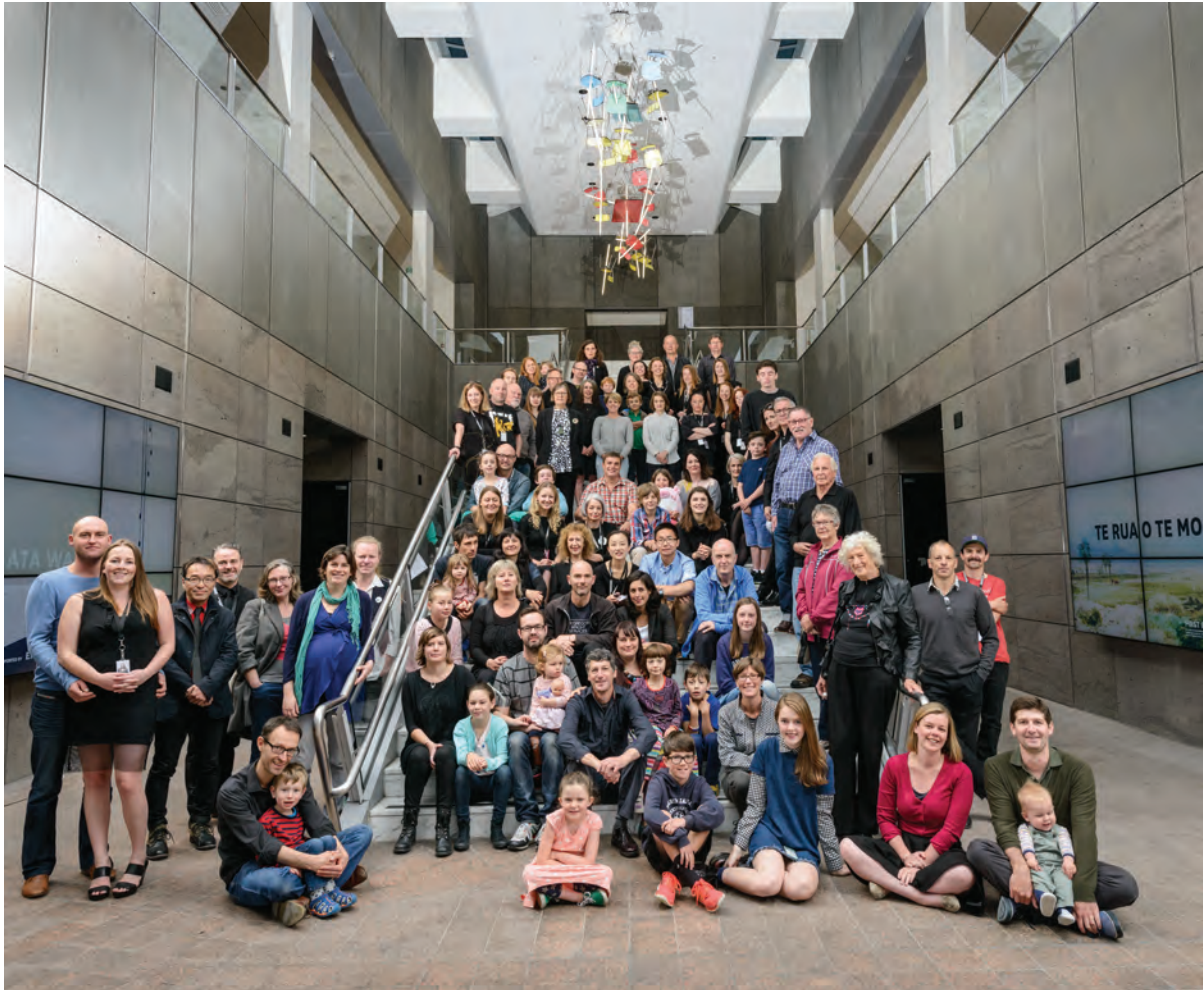
The staff of Christchurch Art Gallery Te Puna o Waiwhetu and their families, 18 December 2015.