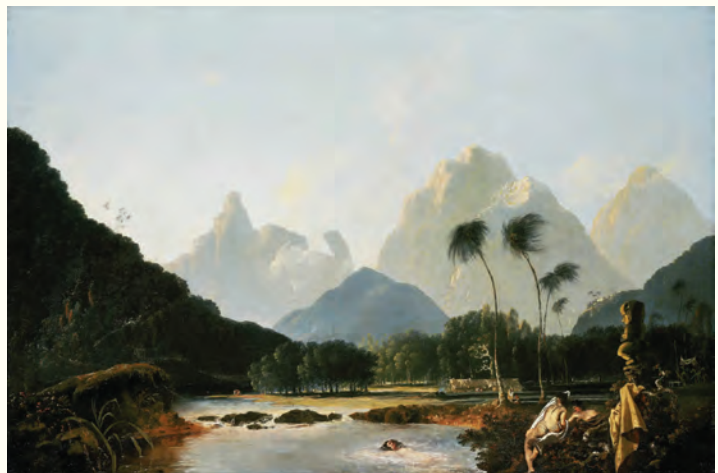
William Hodges A View taken in the bay of Oaite Peha [Vaitepiha] Otaheite [Tahiti] (Tahiti Revisited) 1776 . Oil on canvas. National Maritime Museum, Greenwich, London, Ministry of Defence Art Collection

William Hodges accompanied Captain Cook on his second voyage to the Pacific. His vivid paintings of Tahiti, New Zealand and the Pacific Islands were the first such images widely seen in Europe. Later he travelled extensively in northern India, and once again his paintings of landscapes and monuments were a revelation for audiences at home. This film reviews his complex, beautiful art.