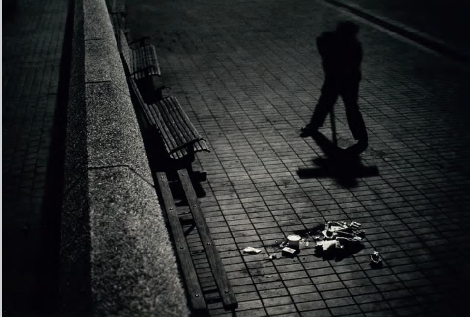
David Cook Cathedral Square 1983. Photograph. Collection of Christchurch Art Gallery Te Puna o Waiwhetu, purchased 1987