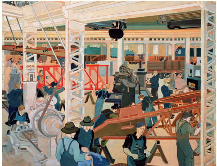
Louise Henderson Addington Workshops 1930. Oil on board. Collection of Christchurch Art Gallery Te Puna o Waiwhetu, Dame Louise Henderson Collection, presented by the McKegg Family 1999