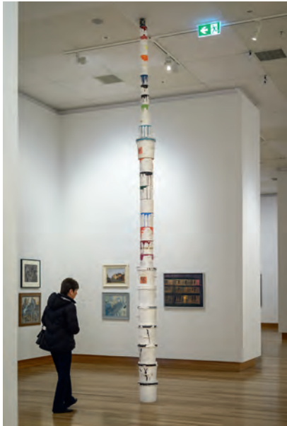
Glen Hayward Yertle 2011. Wood (kauri, pine, pūriri, rimu, tōtara), acrylic paint, wire. Collection of Christchurch Art Gallery Te Puna o Waiwhetu, purchased 2011

from the expressions on some visitors' faces, it's obvious that's just what they'd like to do. Motivated by as much irritation as curiosity, they stalk around it—but they're in for a surprise. The bin that seemed empty is actually full, stuffed not with last week's newspapers or the weekend's empties, but wood. Or more accurately, like all of Hayward's works in Unseen —and like Yertle , his teetering paint-pot tower upstairs—it's been carved from wood and then painted with Machiavellian attention to detail. Like Sheehan (and unlike Duchamp) the artist didn't go out into the world to gather everyday objects; he went back to his studio and made them by hand. It's interesting to witness the recalibration in visitors' attitudes as they process this difference: suddenly what seemed like a trashy plastic intrusion represents hours of meticulous labour and considerable skill. And by lavishing such time and attention on something that's all about what's thrown away, Hayward invests his works and process not only with humour, but with an unexpected